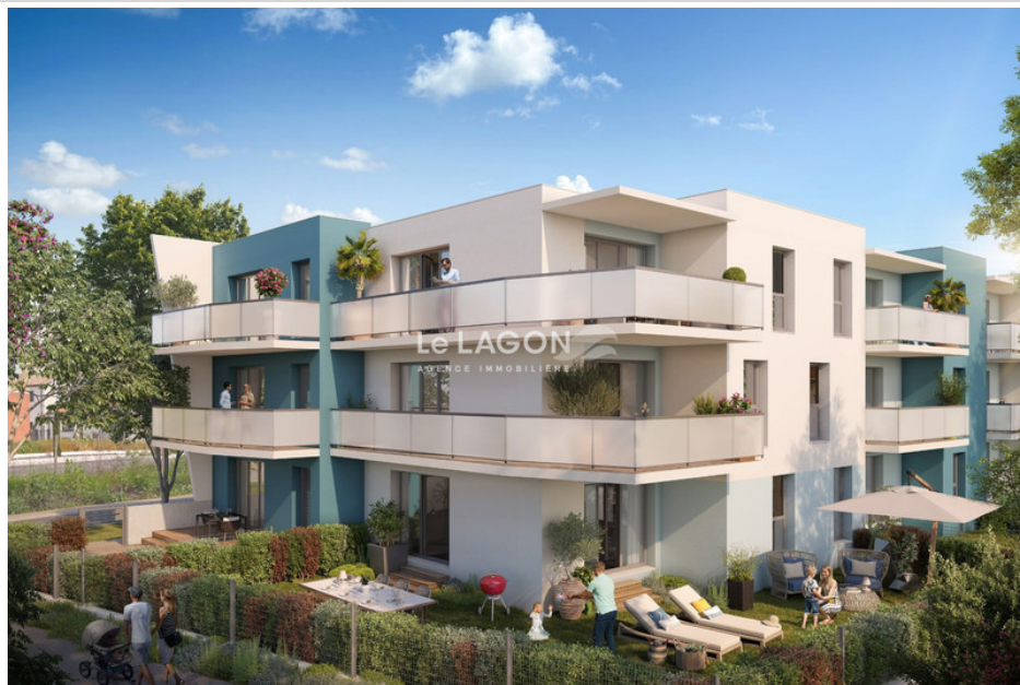
Apartment 3369 Saint-Cyprien

In a particularly private and quiet environment, close to all amenities, in a new, high-end, secure condominium with elevator, 26 apartments from type 2 to type 4. On the first floor, a NEW Premium 4-room apartment with a surface area of 95.70 m 2 including an entrance to a large living space of approximately 42 m 2 opening onto a south-facing balcony of almost 25 m 2 , a master bedroom of approximately 23 m 2 with storage and shower room, and another sleeping area with 2 beautiful bedrooms, one of which has a fitted wardrobe, opening onto the balcony, a fitted shower room with walk-in shower, and a separate toilet. The apartment has a garage and a parking space. Apartment services: RE2020 construction standards, single-piece PVC joinery with electric roller shutters except in the bathroom, solid laminated core landing door equipped with 3-point locks, fitted cupboards with sliding doors, 60x60 tiles and 20x60 earthenware tiles to choose from the Client's range, fitted kitchen, vanity unit + mirror + mixer tap + taps, shower tray, ducted air conditioning, towel dryer (SDE), thermodynamic DHW tank, humidity-controlled VMC, wall-hung toilet, antenna and RJ45 socket, interior painting (walls, ceilings and frames), terrace on tiled pads. Residence amenities: